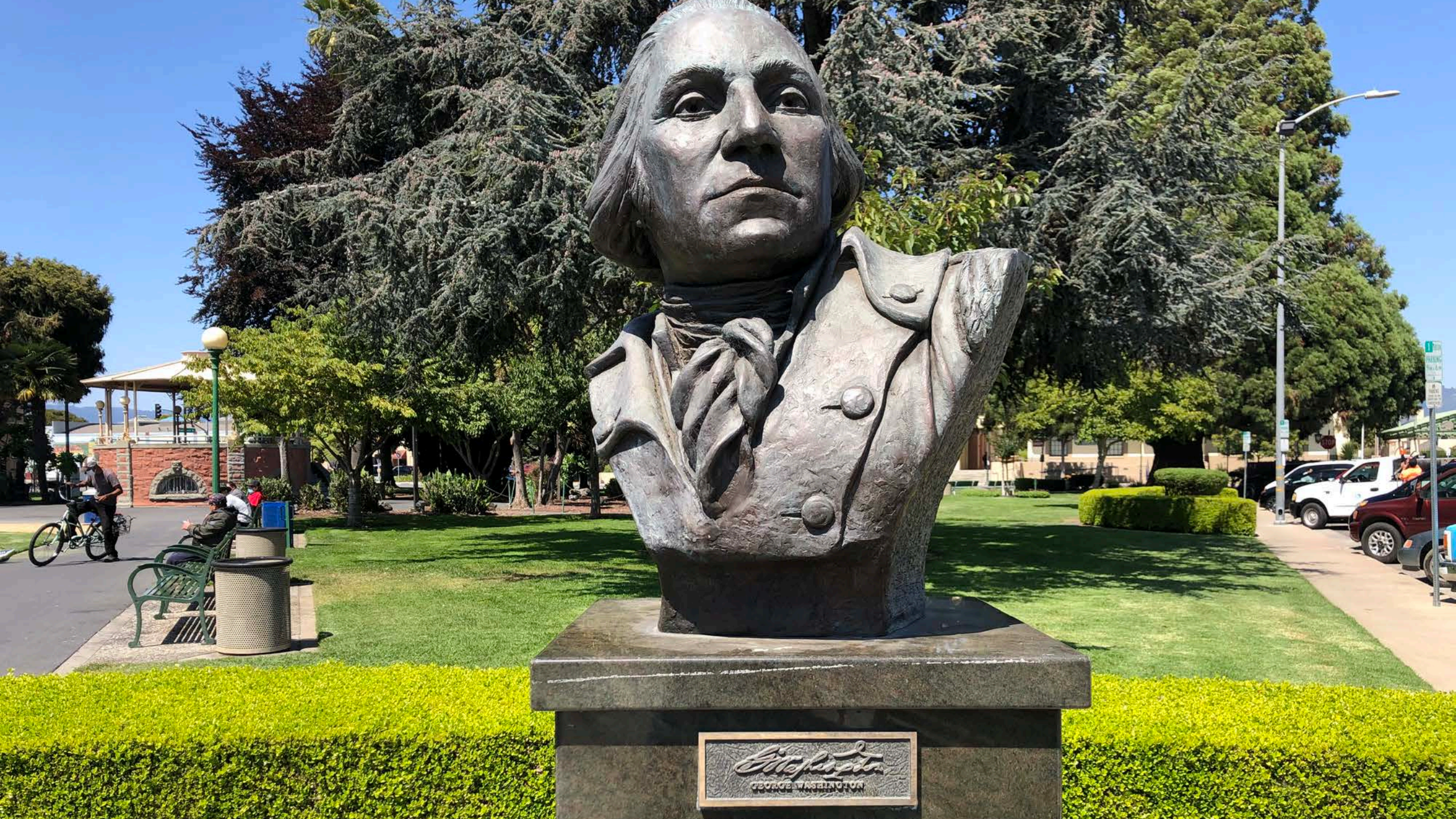
George Washington GEORGE WASHINGTON